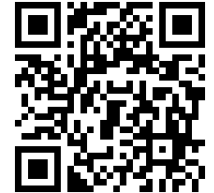
HP QR code

The library's homepage is the gateway to services offered on the Internet, such as e-journals, e-books, various databases, collection search, and MyLibrary. We hope you will take advantage of these convenient features.